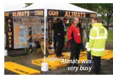
Alimats was very busy