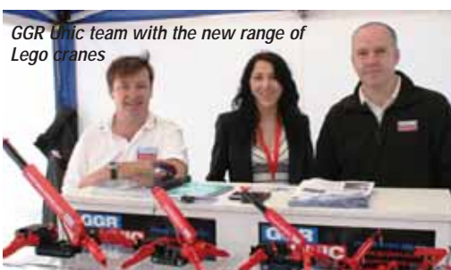
GGR Unic team with the new range of Lego cranes