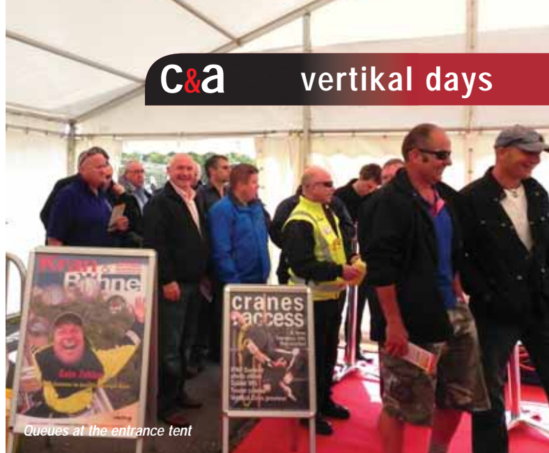
Queues at the entrance tent

Vertikal Days is not about visitor volumes - with food and drink included rent-a-crowd- is not a viable option- it is about quality with visitors who have a genuine interest and need for the products on show and this was reinforced by