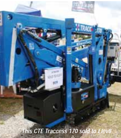
This CTE Traccess 170 sold to Elev8