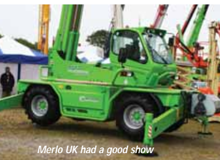
Merlo UK had a good show