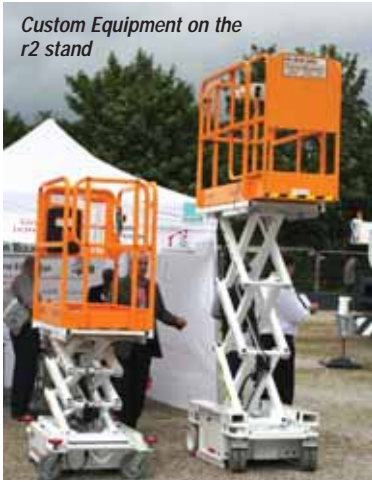
Custom Equipment on the r2 stand