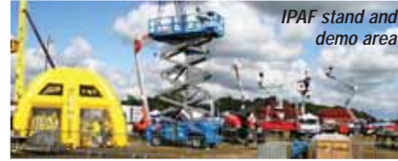
IPAF stand and demo area