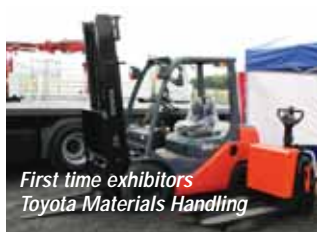
First time exhibitors Toyota Materials Handling