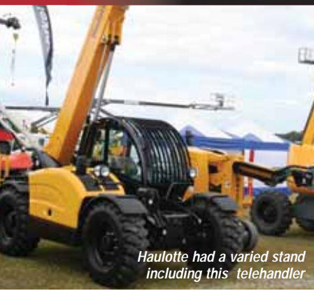
Haulotte had a varied stand including this telehandler