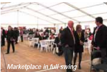
Marketplace in full swing