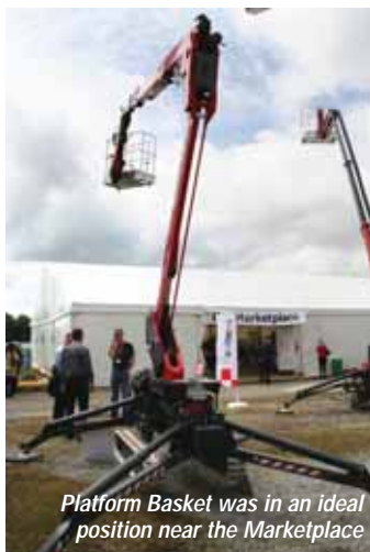
Platform Basket was in an ideal position near the Marketplace