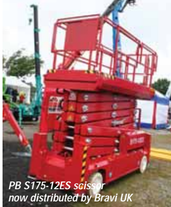
PB S175-12ES scissor now distributed by Bravi UK