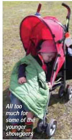
All too much for some of the younger showgoers