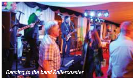
Dancing to the band Rollercoaster