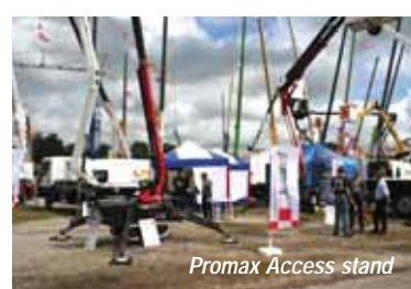
Promax Access stand