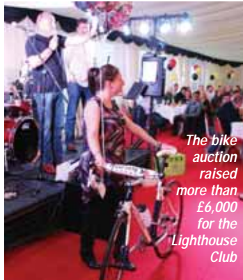
The bike auction raised more than £6,000 for the Lighthouse Club