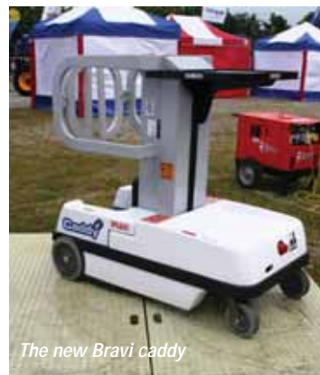
The new Bravi caddy