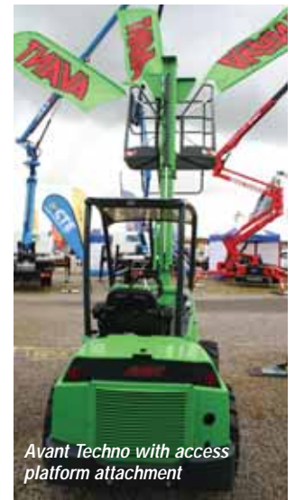
Avant Techno with access platform attachment