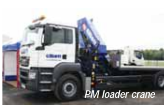
PM loader crane