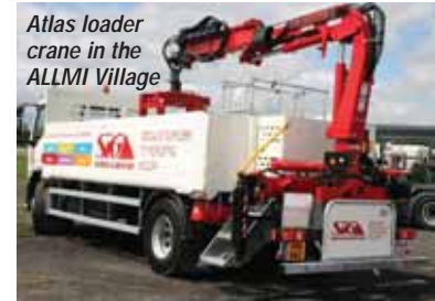
Atlas loader crane in the ALLMI Village