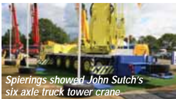
Spierings showed John Sutch's six axle truck tower crane