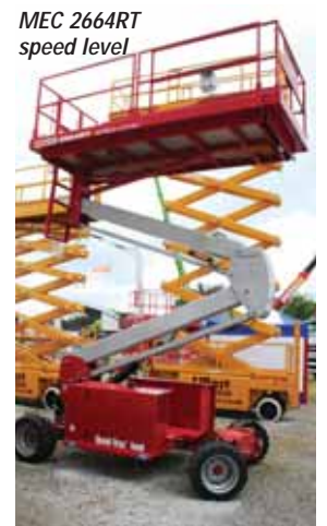
MEC 2664RT speed level