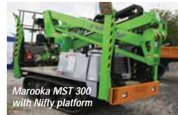
Marooka MST 300 with Nifty platform