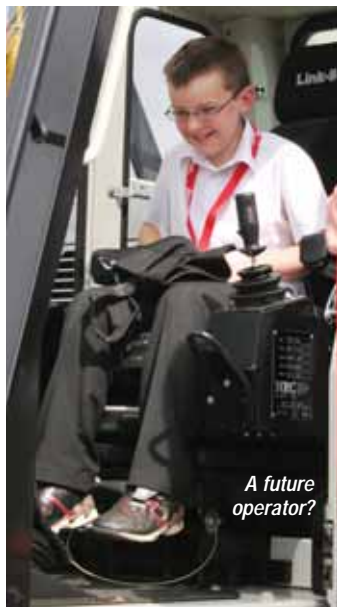
A future operator?

Feedback from those attending reinforced the decision to continue with the basic 'laid-back friendly format' combined with the 'no charge' all inclusive philosophy - from free parking to free lunch and drinks - it is no surprise that the show's popularity is growing.