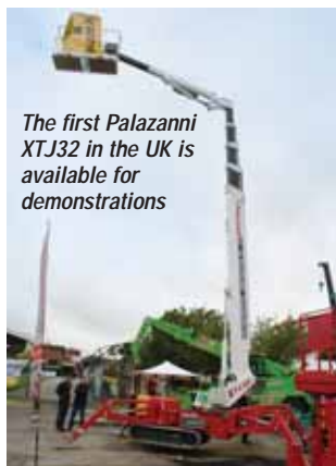
The first Palazanni XTJ32 in the UK is available for demonstrations