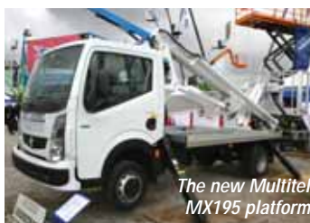
The new Multitel MX195 platform