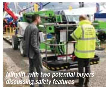
Niftylift with two potential buyers discussing safety features