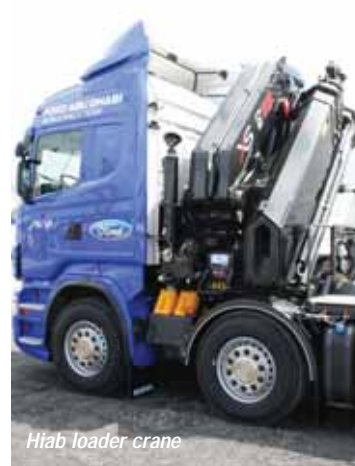
Hiab loader crane