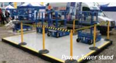
Power Tower stand