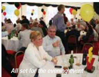
All set for the evening event