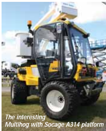
The interesting Multihog with Sorage A314 platform