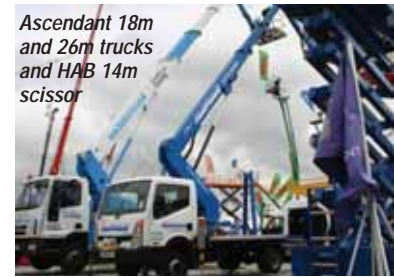
Ascendant 18m and 26m trucks and HAB 14m scissor