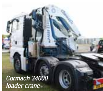
Cormach 34000 loader crane