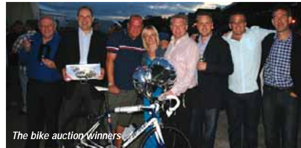
The bike auction winners