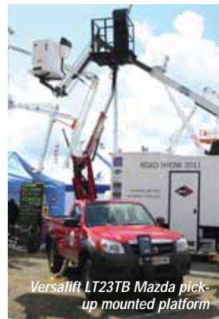
Versalift LT23TB Mazda pick-up mounted platform