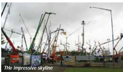
The impressive skyline