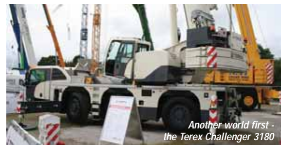
Another world first - the Terex Challenger 3180