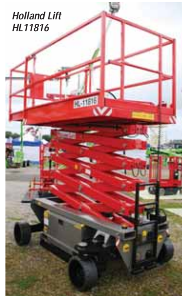
Holland Lift HL11816