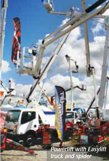
Powerlift with Easylift truck and spider