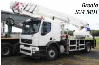
Bronto S34 MDT