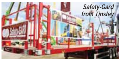
Safety-Gard from Tinsley