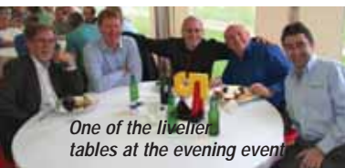
One of the livelier tables at the evening event