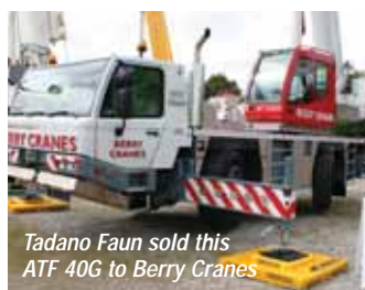
Tadano Faun sold this ATF 40G to Berry Cranes