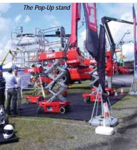
The Pop-Up stand