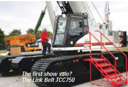
The first show sale? The Link Belt TCC750