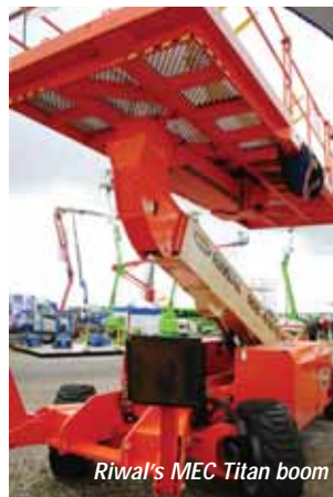
Riwal's MEC Titan boom