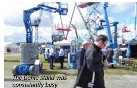
The Genie stand was consistently busy