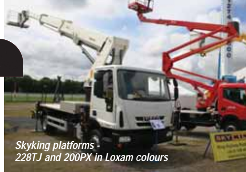
Skyking platforms - 228TJ and 200PX in Loxam colours