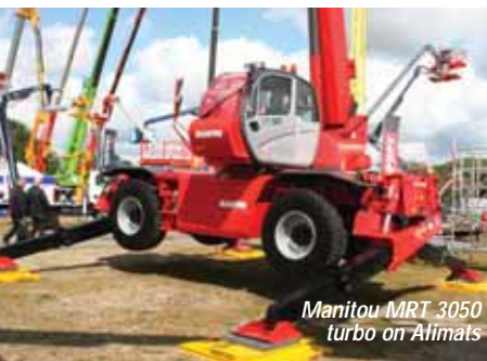
Manitou MRT 3050 turbo on Allmats