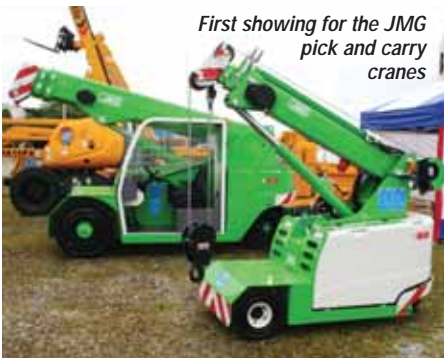
First showing for the JMG pick and carry cranes