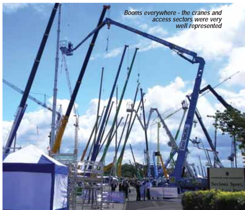
Booms everywhere - the cranes and access sectors were very well represented