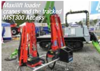
Maxilift loader cranes and the tracked MST300 Access