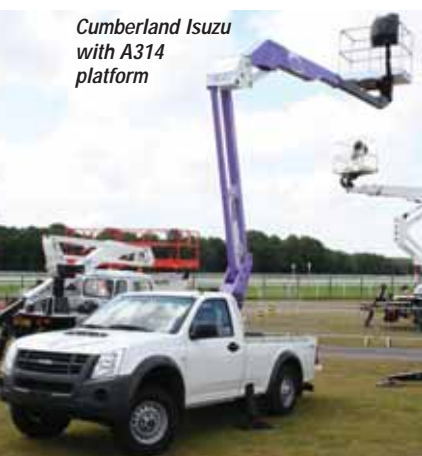
Cumberland Isuzu with A314 platform