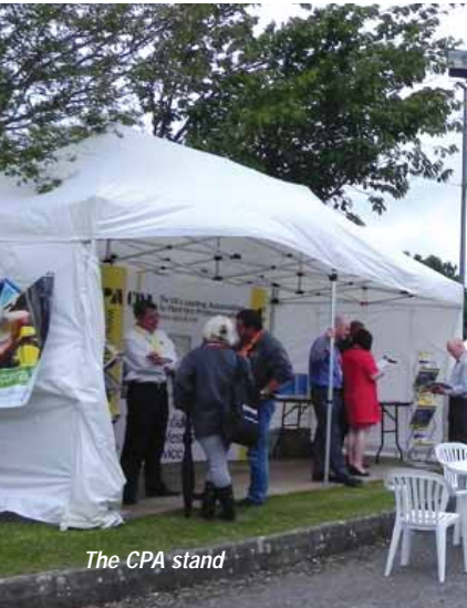
The CPA stand