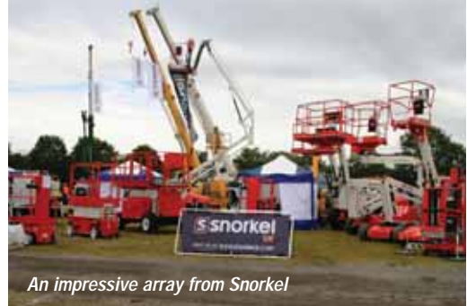
An impressive array from Snorkel