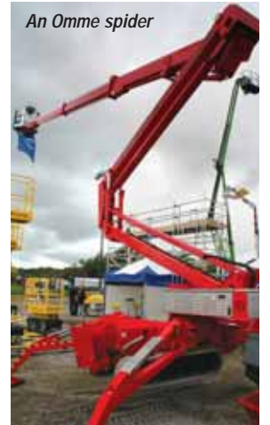
An Omme spider