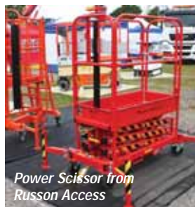
Power Scissor from Russon Access