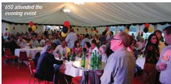
650 attended the evening event